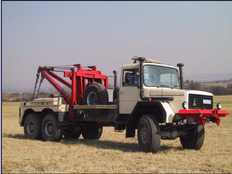
Samil 100 Recovery Unit