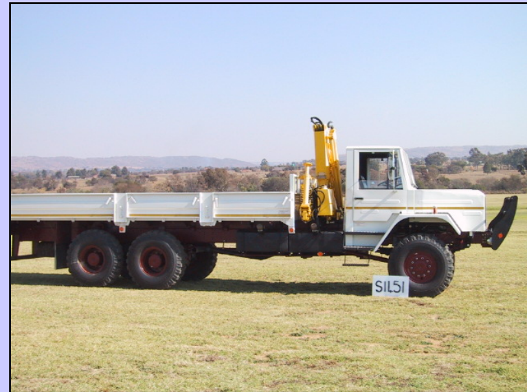
Samil 100 Crane Truck