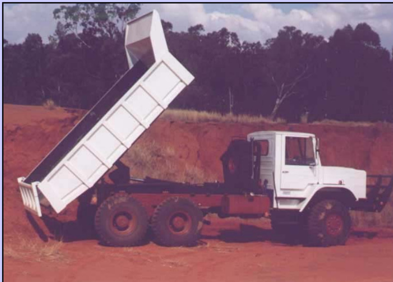
Samil 100 Tipper